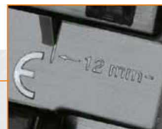
Embossed cable stripping mark